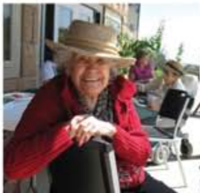
When our residents "horse around" we mean it!